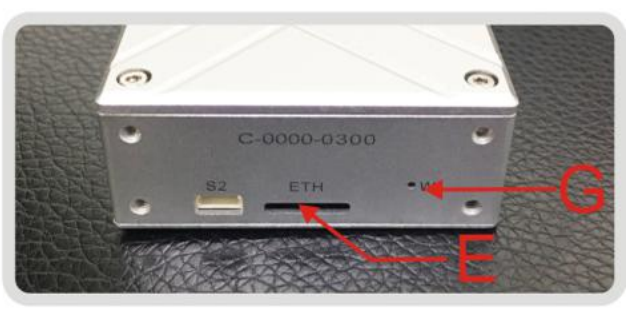
E: 1*100Mbps Ethernet G: WL Signal Indicator