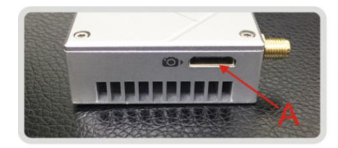
A: 1* Mini HDMI Port on TX & RX