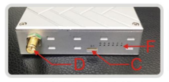
C: 1*TTL 232 Bidirectional Serial Port